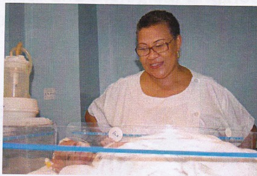
Sharing for better healthcare

The conference will be held in English and French, with simultaneous translation of most sessions.